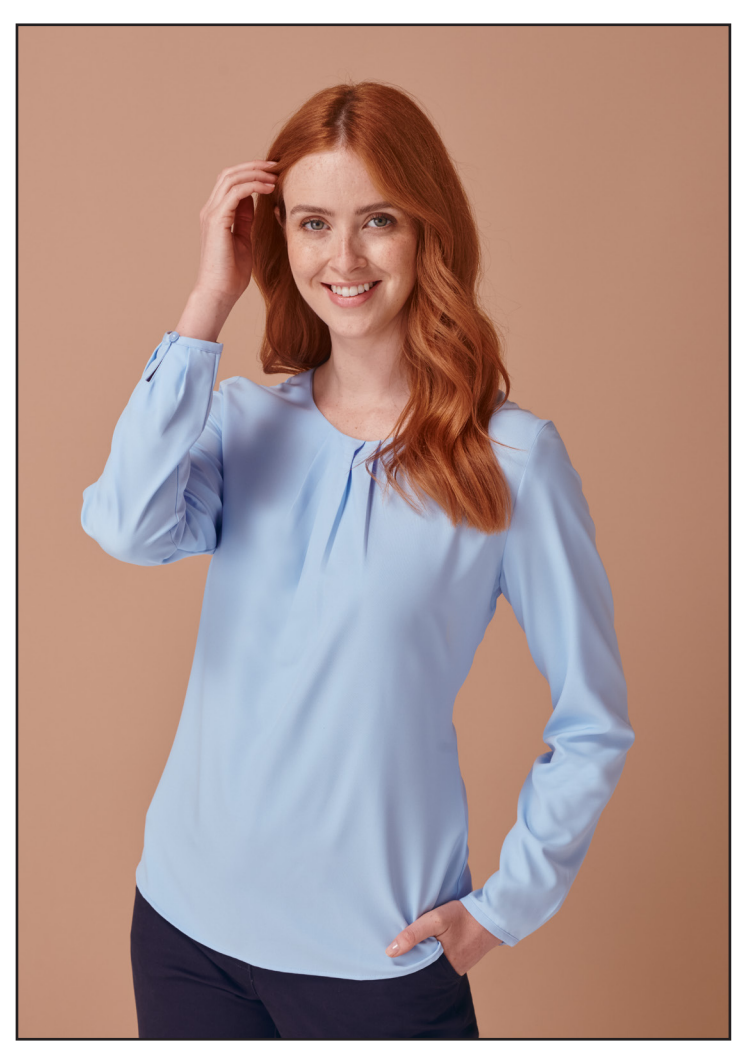
H598 Ladies' Pleat Front Long Sleeved Blouse