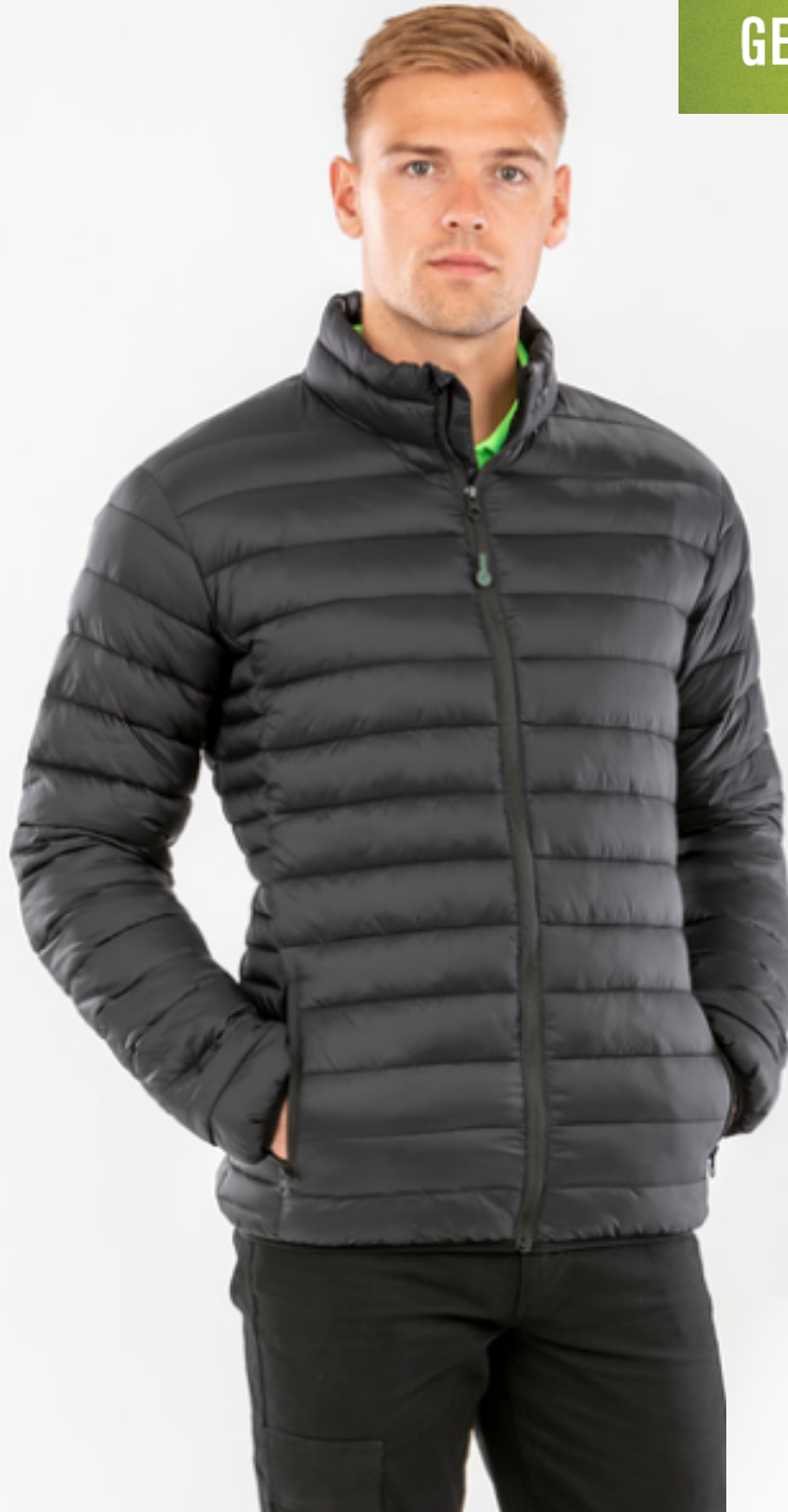
R912X RECYCLED PADDED JACKET