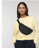
Lightweight Hip Bag

Shell : Plain Weave , 100% Recycled polyester , Fluorine-free DWR , 75 GSM