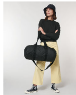
Lightweight Duffle Bag

Shell : Plain Weave , 100% Recycled polyester , Fluorine-free DWR , 75 GSM